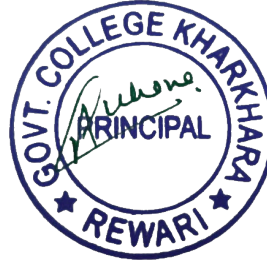
Principal Govt. College, Kharkhara (Rewari)